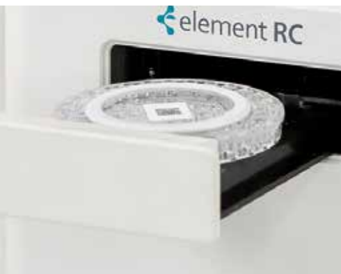
2 Insert rotor