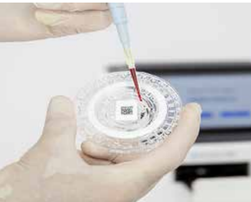
1 Pipette sample