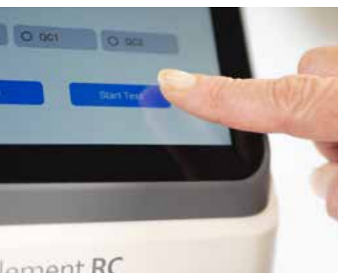
3 Start measurement