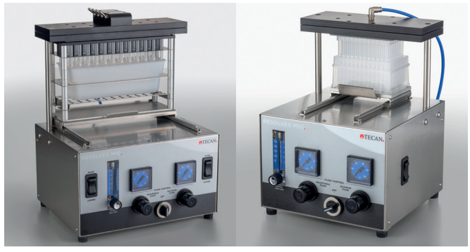
Resolvex M10 48: for 1, 3, and 6 ml cartridges